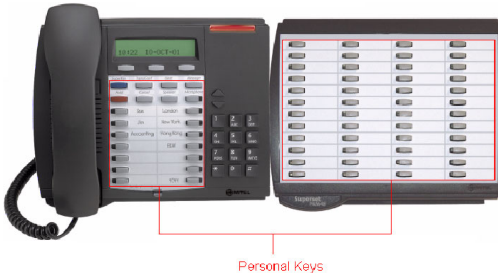
Figure 3, 5020 IP Phone with 5415 PKM attached

The following illustration shows the personal keys available on your Mitel Networks 5020 IP Phone, and when attached to a Mitel Networks 5415 PKM.