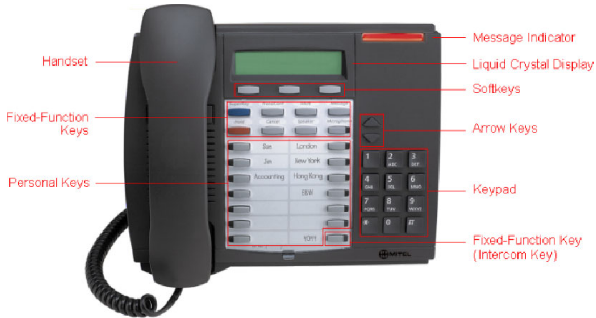
Figure 1, Mitel Networks 5020 IP Phone

The Mitel Networks 5020 IP Phone features dual ports which allows your telephone to be attached to a PC as well as the telephone network, an easy-to-read display, a Message Waiting Indicator, three softkeys, nine fixed-function keys, thirteen personal keys and two arrow keys ( ▲ and ▼ ).