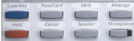
Figure 2, Fixed Function Keys on your 5020 IP Phone

Each personal key may be programmed with: