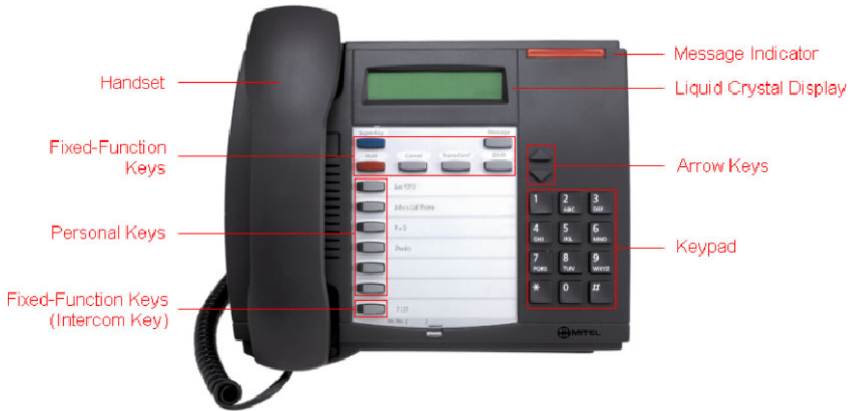
Figure 1, Mitel Networks 5010 IP Phone

The Mitel Networks 5010 IP Phone features dual ports which allows your telephone to be attached to a PC as well as the telephone network, an easy-to-read display, a Message Waiting Indicator, seven fixed-function keys, six personal keys and two arrow keys ( ▲ and ▼ ).