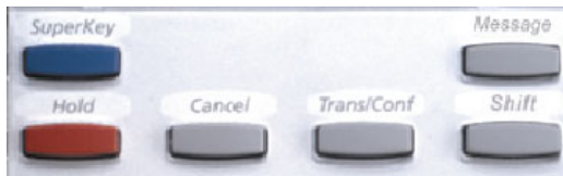
Figure 2, Fixed Function Keys on your 5010 IP Phone

The seven fixed-function keys are: SuperKey , Trans/Conf , Shift , Message , Hold , Cancel , and Intercom ; these keys, and the ▲ and ▼ keys, are described in detail under Fixed Function Keys .