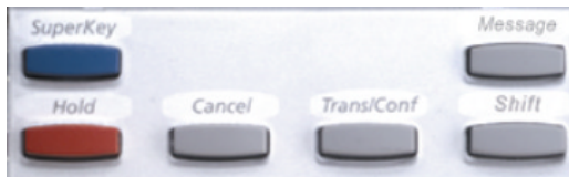
Figure 2, Fixed Function Keys on your 5010 IP Phone

The seven fixed-function keys are: SuperKey , Trans/Conf , Shift , Message , Hold , Cancel , and Intercom ; these keys, and the ▲ and ▼ keys, are described in detail under Fixed Function Keys .