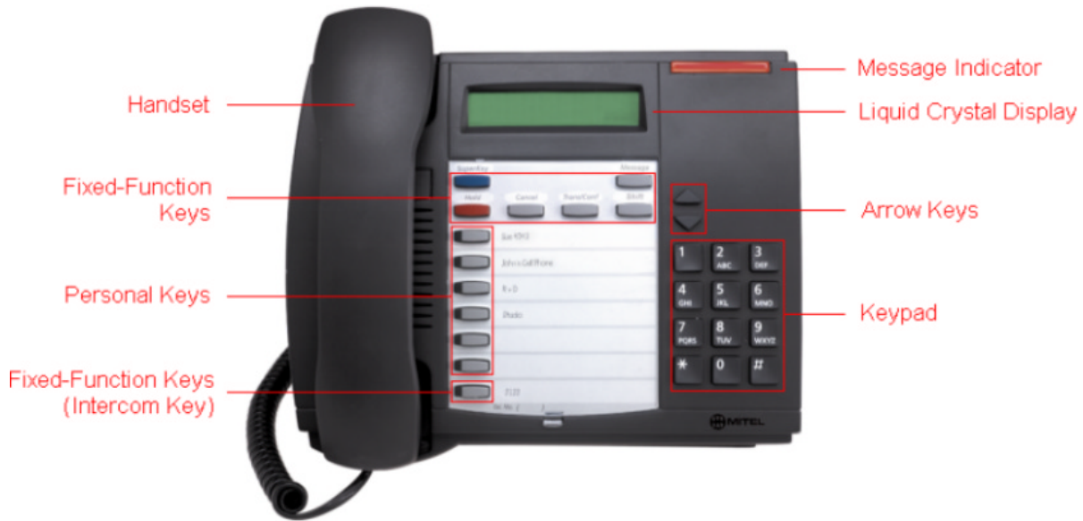
Figure 1, Mitel Networks 5010 IP Phone

The Mitel Networks 5010 IP Phone features dual ports which allows your PC and telephone to share a single network connection, an easy-to-read display, a Message Waiting Indicator, seven fixed-function keys, six personal keys and two arrow keys ( ▲ and ▼ ).