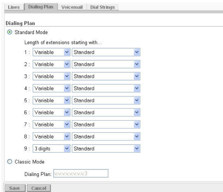
Figure 2: Voice Mail Line Group Dialing Plan